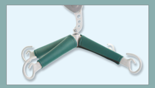
4 Point Yoke